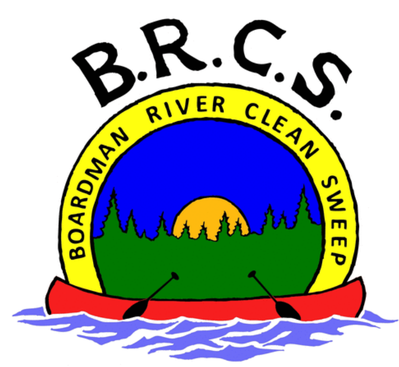
Keeping The Boardman Clean, Cold And Beautiful